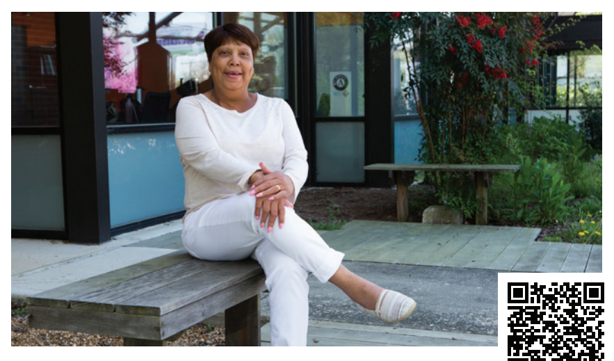
To learn more, align the camera app on your iPhone or Android with the QR code and follow the pop-up link.

When they told me I was approved, I couldn't believe it. But I knew it was going to be okay. Because of Medicaid, I would be able to get what I needed."