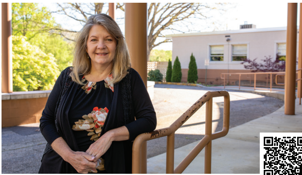
To watch full video, align the camera app on your iPhone or Android with the QR code and follow the pop-up link.