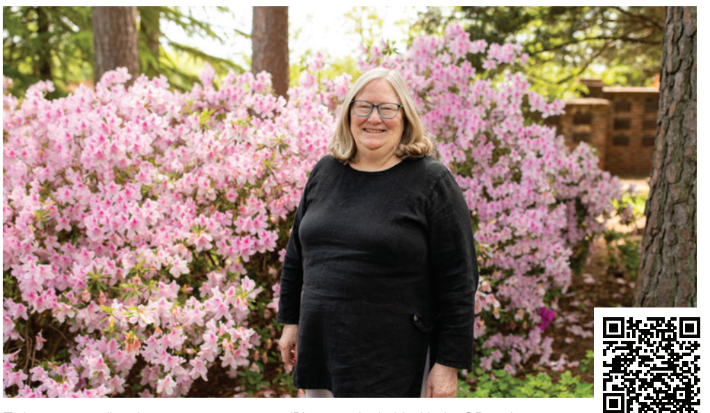
To learn more, align the camera app on your iPhone or Android with the QR code