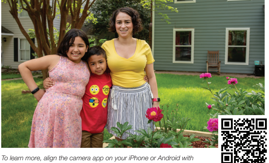
the QR code and follow the pop-up link.

"Our family would have been devastated without Medicaid. which allowed my daughter to have the surgeries, aftercare, therapy and mental health support she needed to thrive. We didn't have to choose between paying for groceries and paying for her health care."