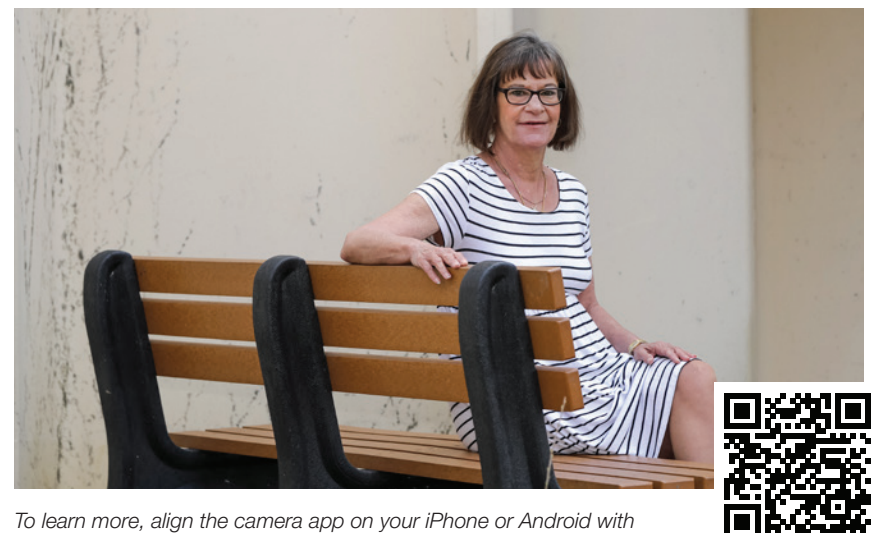
To learn more, align the camera app on your IPhone or Android with the QR code and follow the pop-up link.

Without Medicaid, I wouldn't be here. I wouldn't have been able to get the treatments I needed. Medicaid saved my life.